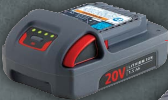
1.5 Ah battery – BL2005

High-power, 20-volt lithium-ion battery delivers high-charge capacity and low internal impedance for maximum power delivery and exceptional runtime