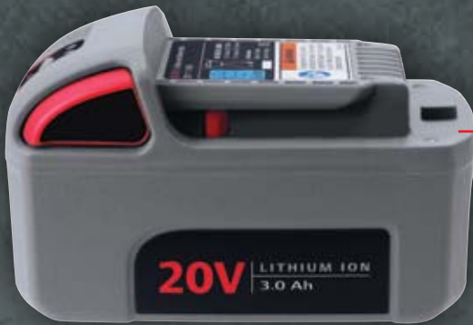
3.0 Ah battery – BL2010